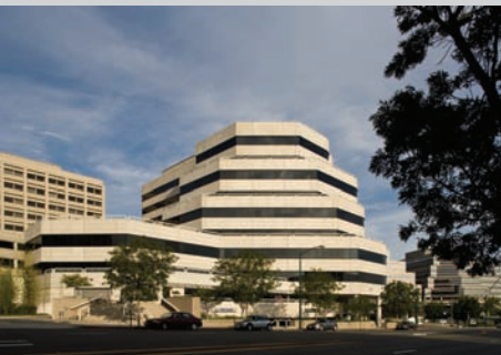
LEGACY YGNACIO CENTER Walnut Creek, CA

Description: A two building office complex built in 1990 with an architecturally unique design and premier West Valley location. The property appeals to the area's most prestigious tenants who enjoy an attractive central fountain courtyard setting, generous window lines with panoramic views, an executive fitness center, and subterranean parking. The property's prime location also affords tenants exceptional convenience to numerous retailers, executive housing, a Light Rail station and San Jose International Airport.