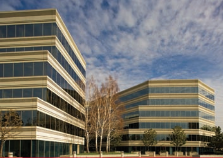
LEGACY HAMILTON PLAZA Campbell, CA