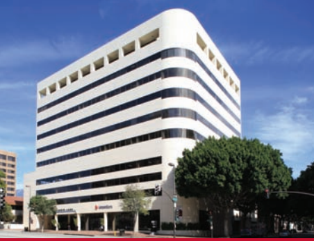
70 SOUTH LAKE Pasadena, CA